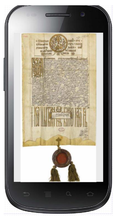
Fig. 3. Historical document from Seals -History Treasure exhibition

can be carefully studied in order to discover all the security elements used in that period of time to secure a document.