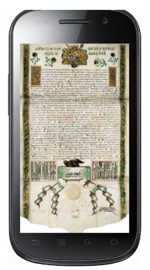
Fig. 2. Mobile view of Seals - History Treasure exhibition

attractive virtual exhibitions, such as presented in Figures 2 and 3.