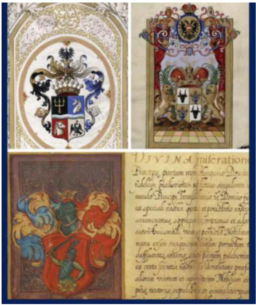
Fig. 4. Documents from Seals - History Treasure exhibition

Figure 4 presents historical documents that were included in the Seals - History Treasure exhibition catalogue. They are important cultural components of the exhibition and they can be physically found only at the Romanian Academy Library.